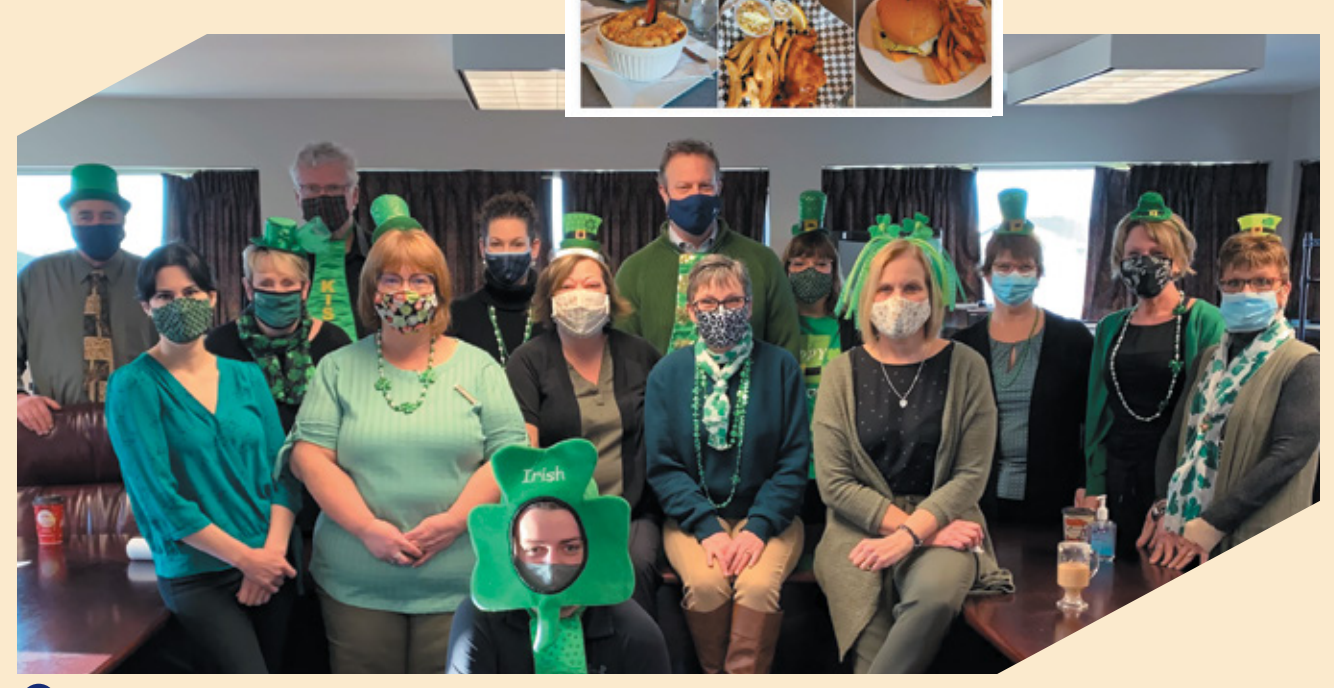
No matter what the occasion, you can always count on the Malpeque Bay staff to get into the spirit, including Saint Patrick's Day

Our Montague staff found our Loyal 2 Local Challenge to be a challenge they enjoyed!